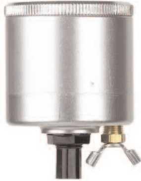
TD5 Tank Drain

The TD5 Tank Drain can be effectively used at the bottom of any drop leg to remove the water that builds up in many piping systems, prior to the air entering the filter/dryer system that is used to polish your air for your air tools, equipment, or spraying applications.